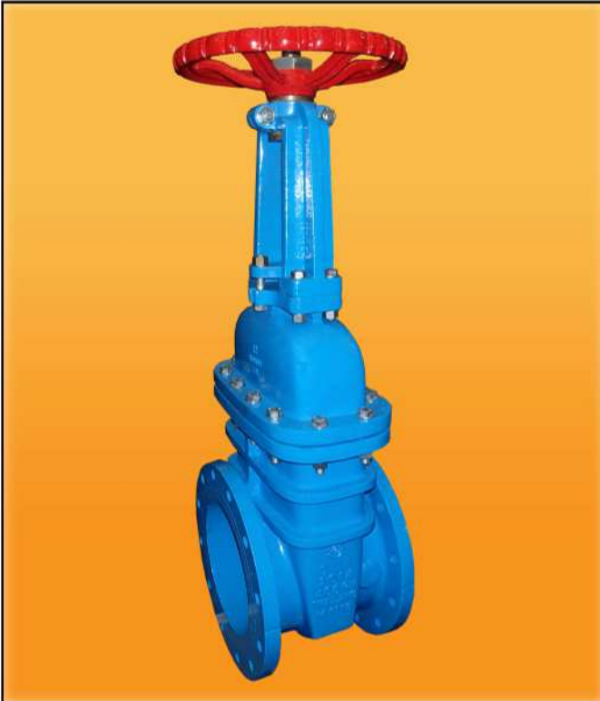
Fig.172 MODEL 105U